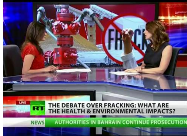
RT anti-fracking reporting (RT, 5 October)